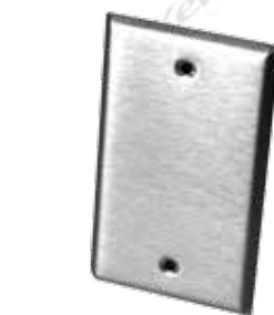
ACI Flush Mount Sensor