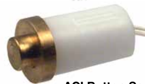
ACI Button Sensor